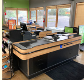
Front end AFTER update